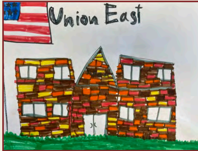
Suzan Tshala, Union East Elementary School

8 Picture Day 13 Open House 14 Senior Portraits 25-29 Homecoming Week 26 Powder Puff Game 29 Homecoming Football Game 30 Homecoming Dance, 7-10pm